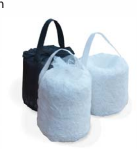
Disposable elements trap and contain compressor lubricants

element bags within the system trap lubricants but allow water to pass through. With lubricant carryover demonstrated to be 10 PPM or less, the conditioned water meets stringent EPA guidelines and conforms to State and local codes for safe discharge. Disposal, as required by federal and municipal guidelines, is necessary for only the oil-soaked elements.